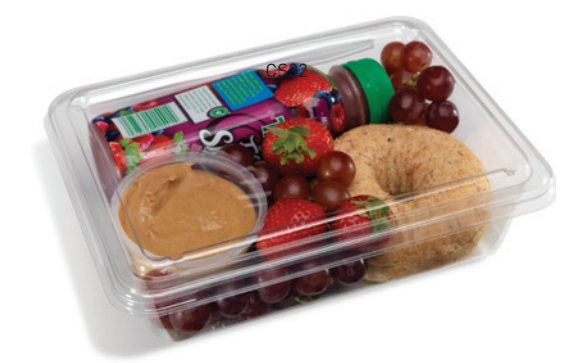
The versatility of Fresh'n Clear™ Trays lets you create grab-and-go kits of edible delights. For you, they're easy to assemble. For your customer, they're easy to carry and easy to buy!