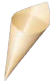
7" CONE sku VT-CN-07 Qty: 1000