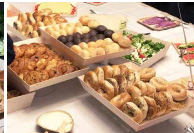
sku TG-CS-IX5, TG-SE-12S