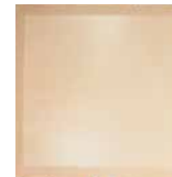
12"x 12"x 1" FIXED SIDED TRAY sku TG-DE-I2S Qty: 100