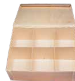
6" x 8" x 3" MEDIUM VENTO™ BOX sku TG-BB-6X8 Qty: 50

Pat. and Pat. Pending: www.verterra.com/patent