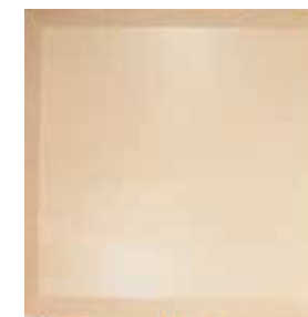
16"x 16"x 1" FIXED SIDED TRAY sku TG-DE-I6S Qty: 50