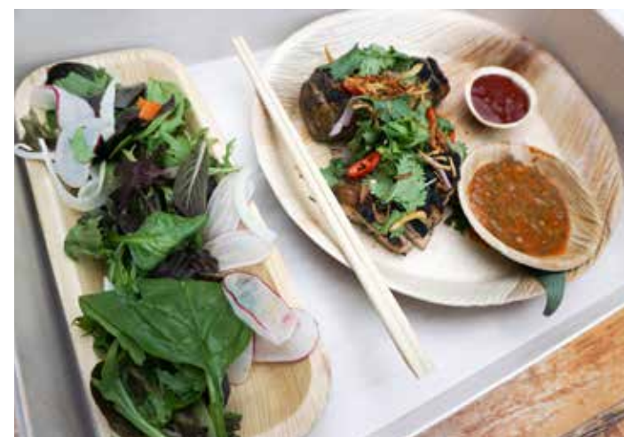
sku 01-22-18B, 01-01-25B, 01-01-10B, 01-01-02B