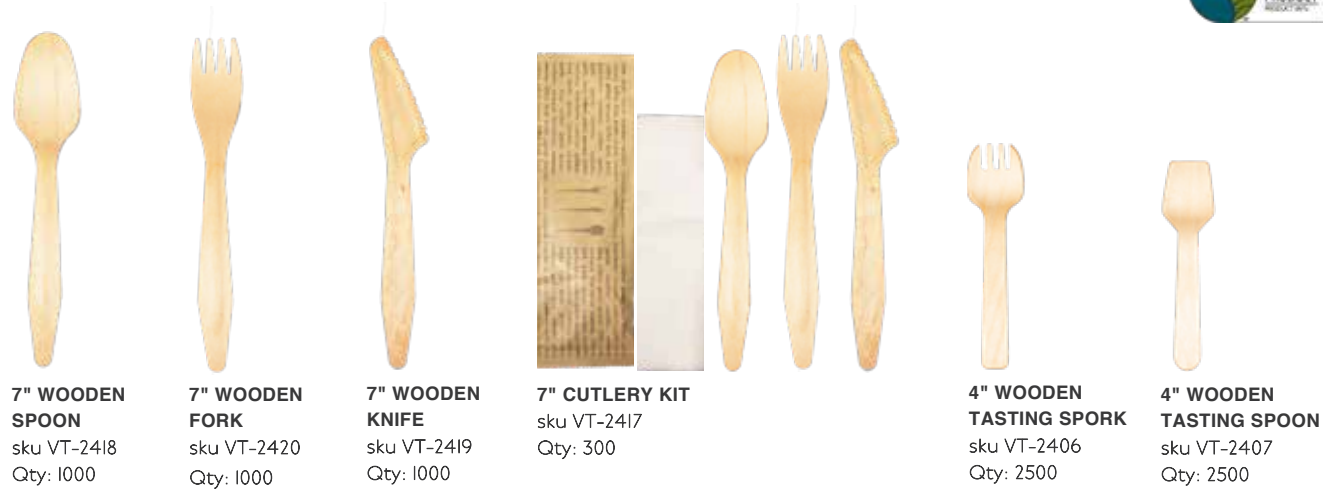
7" WOODEN SPOON sku VT-2418 Qty: 1000 7" WOODEN FORK sku VT-2420 Qty: 1000 7" WOODEN KNIFE sku VT-2419 Qty: 1000 7" CUTLERY KIT sku VT-2417 Qty: 300 4" WOODEN TASTING SPOON sku VT-2406 Qty: 2500 4" WOODEN TASTING SPOON sku VT-2407 Qty: 2500