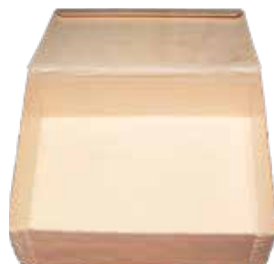
8" x 12" X 2" LARGE BOX sku TG-CB-IX8 Qty: 100