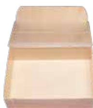
4" x 6" x 2" SMALL BOX sku TG-CB-4X6 Qty: 300