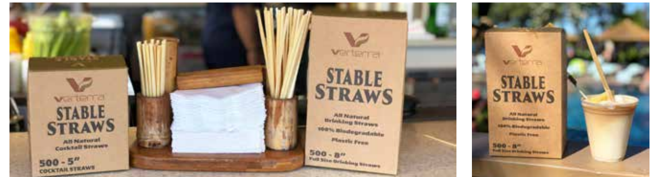
STABLE STRAWS - ALL NATURAL DRINKING STRAWS - 100% BIODEGRADABLE, PLASTIC FREE