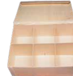
8" x 11" x 3" LARGE VENTO™ BOX sku TG-BB-8XI Qty: 50