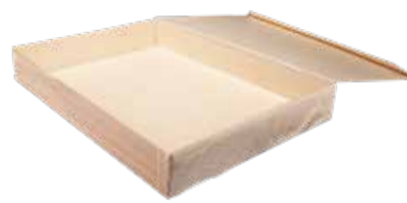
11" x 15" x 2" X- LARGE BOX sku TG-CB-IX5 Qty: 50