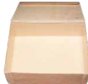
8" x 11" x 3" LARGE BOX sku TG-CB-8XI Qty: 100