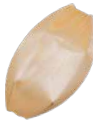
6" WOODEN BOAT sku VT-BT-06 Qty: 1000