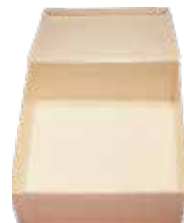
6" x 6" x 1" SMALL BOX sku TG-CB-6X6 Qty: 300