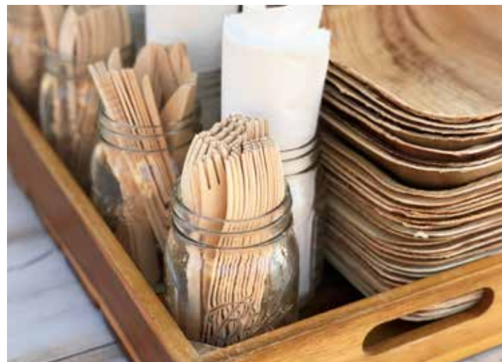
sku VT-2420, VT-2419

Pat. and Pat. Pending: www.verterra.com/patent