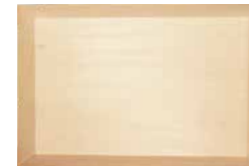
11"x 15"x 1.25" FIXED SIDED LARGE TRAY sku TG-DE-IX5 Qty: 100