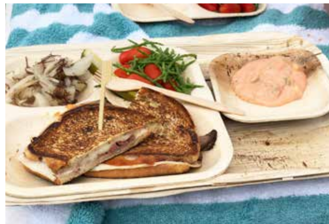
sku 02-25-03C, 01-00-40T, 01-00-18B