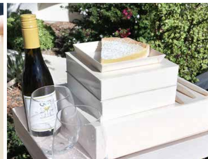
sku TG-CB-7X7, TG-CB-5XI