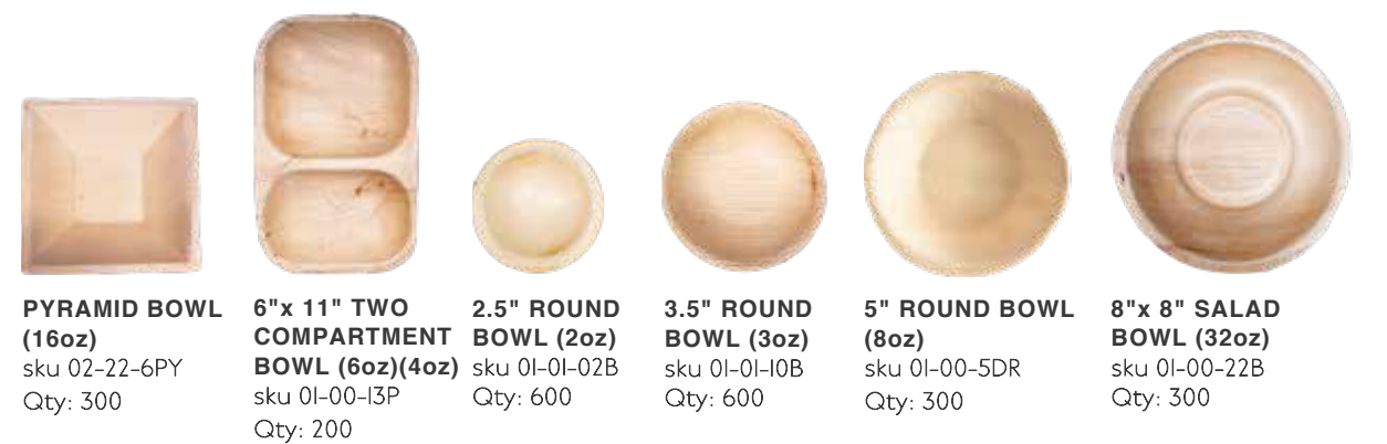
PYRAMID BOWL (16oz) sku 02-22-6PY Qty: 300 6" x 11" TWO COMPARTMENT BOWL (6oz)(4oz) sku 01-00-13P Qty: 200 2.5" ROUND BOWL (2oz) sku 01-01-02B Qty: 600 3.5" ROUND BOWL (3oz) sku 01-01-10B Qty: 600 5" ROUND BOWL (8oz) sku 01-00-5DR Qty: 300 8" x 8" SALAD BOWL (32oz) sku 01-00-22B Qty: 300