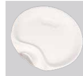
6" WINE GLASS HOLD-A-PLATE sku HP-EP-P6 Qty: 600

Our HOLD-A-PLATE allows you to hold a wine glass or a beverage while also holding an appetizer. Free up a hand with our wine glass plate.