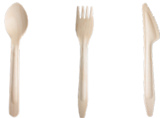
7" WOODEN SPOON sku VT-E2-MS Qty: 1000 7" WOODEN FORK sku VT-E2-MF Qty: 1000 7" WOODEN KNIFE sku VT-E2-MK Qty: 1000