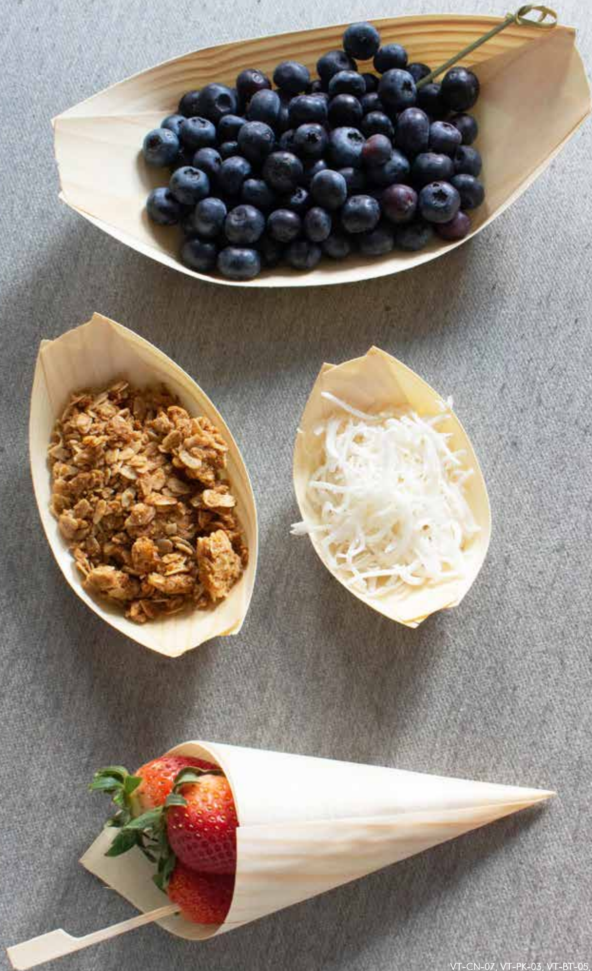
VT-CN-07, VT-PK-03, VT-BT-05, VT-BT-06, VT-BT-08, VT-SK-03