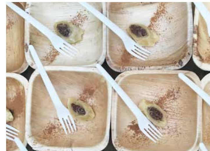
sku 01-22-10D EP-S012

Pat. and Pat. Pending: www.verterra.com/patent