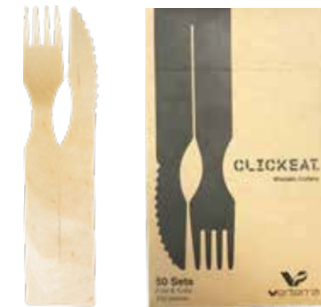
7" WOODEN CLICK N EAT sku VT-CE-FK3 Qty: 600