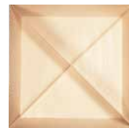
12"x 12"x 4" DEEP 10LB- FIX SIDED VESSEL WITH DIAGONAL PARTITION sku TG-DE-I2D Qty: 50