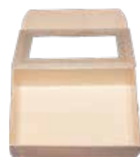
4" x 6" x 2" SMALL BOX W/ WINDOW LID sku WB-CB-4X6 Qty: 300