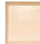
5"x 5" SQUARE sku TG-SE-5X5 Qty: 300