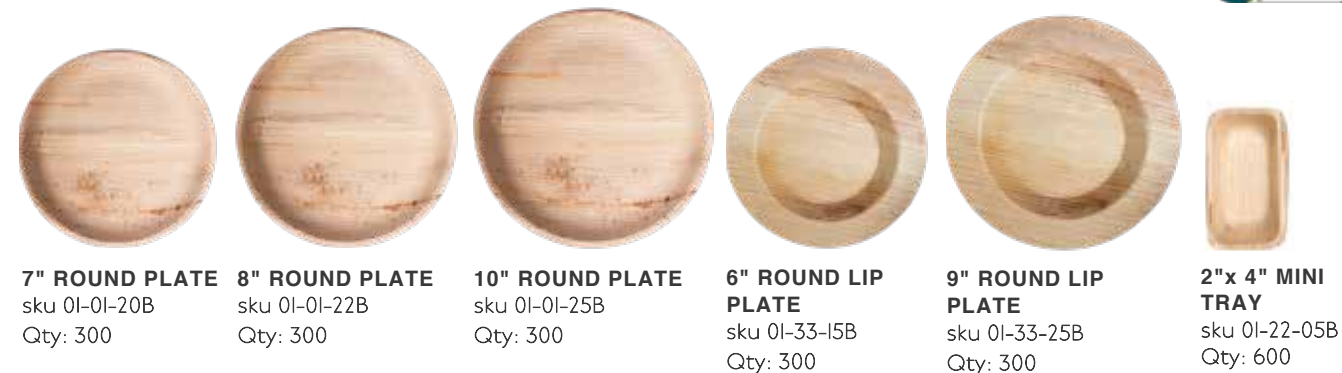
7" ROUND PLATE sku 01-01-20B Qty: 300 8" ROUND PLATE sku 01-01-22B Qty: 300 10" ROUND PLATE sku 01-01-25B Qty: 300 6" ROUND LIP PLATE sku 01-33-15B Qty: 300 9" ROUND LIP PLATE sku 01-33-25B Qty: 300 2"x 4" MINI TRAY sku 01-22-05B Qty: 600