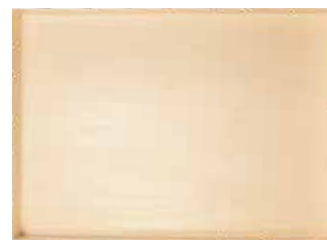
11"x 15"x 2" LARGE COLLAPSIBLE TRAY sku TG-CS-IX5 Qty: 100