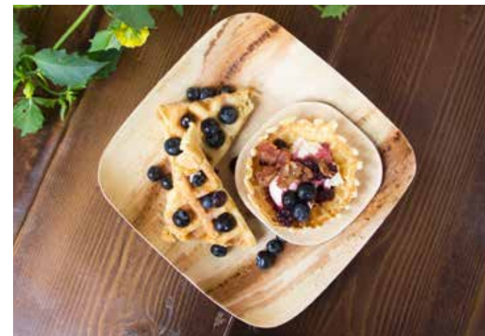
sku 01-20-25B, 01-22-10B