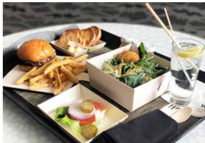
sku TG-DE-5X7, CB-SQ-5X5, TG-DE-07D