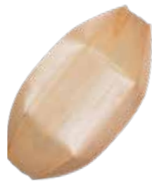
8" WOODEN BOAT sku VT-BT-08 Qty: 1000