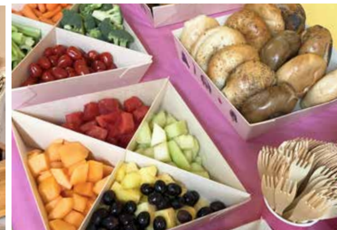
sku TG-DE-12D, TG-DE-07D