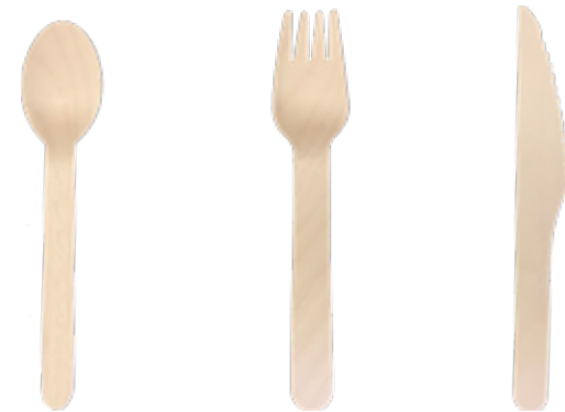
6" WOODEN SPOON sku VT-2405 Qty: 1000 6" WOODEN FORK sku VT-2404 Qty: 1000 6" WOODEN KNIFE sku VT-2406 Qty: 1000

Pat. and Pat. Pending: www.verterra.com/patent