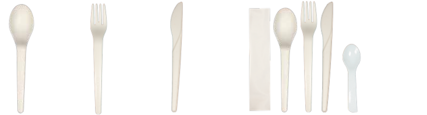
6" PLANTWARE SPOON sku EP-S013 Qty: 1000 6" PLANTWARE FORK sku EP-S012 Qty: 1000 6" PLANTWARE KNIFE sku EP-S011 Qty: 1000 6" PLANTWARE KIT sku EP-S015 Qty: 250 3" PLANTWARE TASTING SPOON sku EP-S016 Qty: 2000

Pat. and Pat. Pending: www.verterra.com/patent