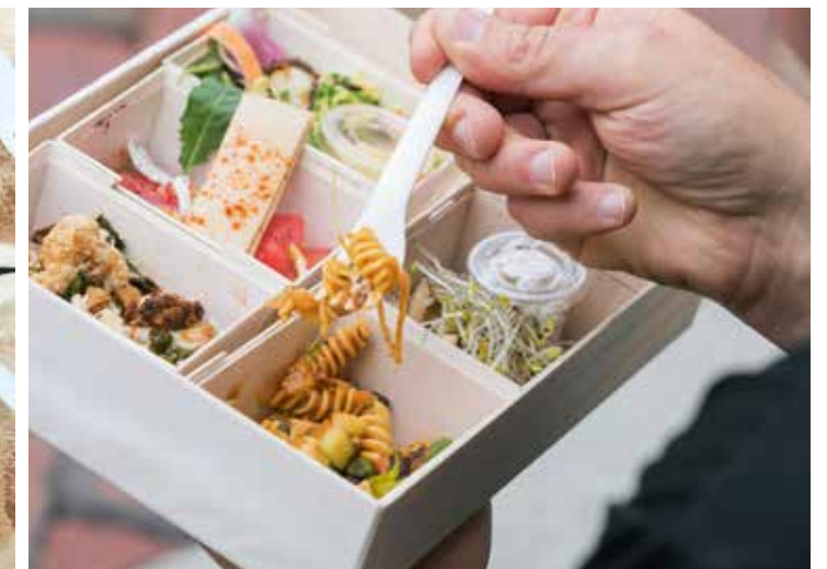
sku TG-CB-8XI, EP-S012