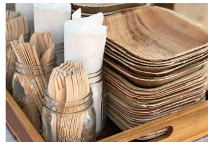
sku VT-2420, VT-2419, 01-00-18B