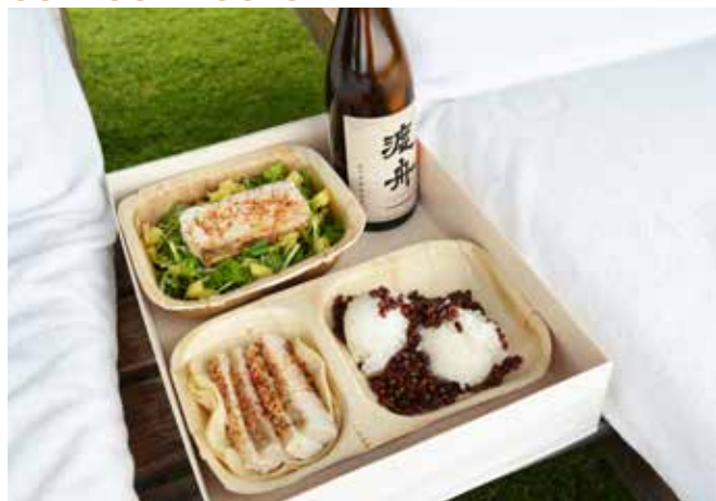
sku 01-00-13P, 01-00-15B, TG-CS-5X1