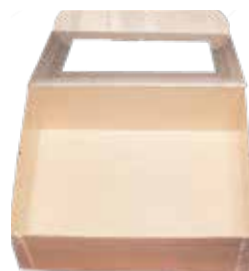
6" x 8" x 3" MEDIUM BOX W/ WINDOW LID sku WB-CB-6X8 Qty: 50