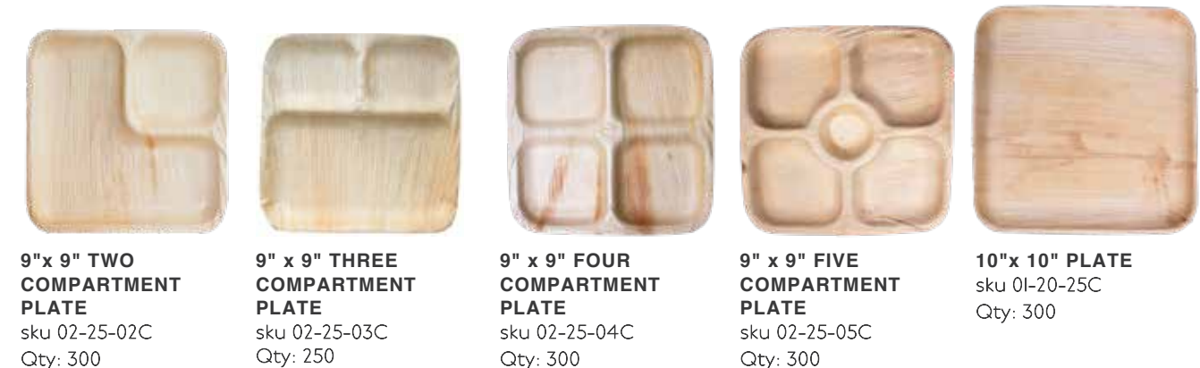
9" x 9" TWO COMPARTMENT PLATE sku 02-25-02C Qty: 300 9" x 9" THREE COMPARTMENT PLATE sku 02-25-03C Qty: 250 9" x 9" FOUR COMPARTMENT PLATE sku 02-25-04C Qty: 300 9" x 9" FIVE COMPARTMENT PLATE sku 02-25-05C Qty: 300 10" x 10" PLATE sku 01-20-25C Qty: 300