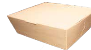
7" X 9" x 3" MEDIUM TO-GO-BOX sku TG-LB-7X9 Qty: 100