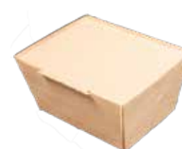
3" X 4" x 2" PETITE TO-GO-BOX sku TG-LB-3X4 Qty: 300

The Click N Lock are two piece double walled boxes. They are extremely durable, stackable, and leak resistant. Ideal for saucy foods.