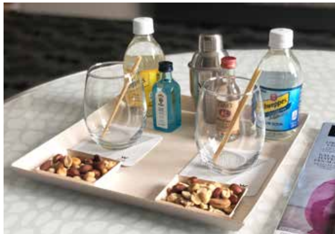
sku TG-DE-2x3, TG-DE-12S, STR-05