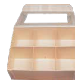
6" x 8" x 3" MEDIUM VENTO™ BOX W/ WINDOW LID sku WB-BB-6X8 Qty: 50