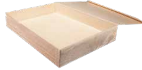
11" x 15" x 3" X-LARGE BOX sku TG-CB-5XI Qty: 50