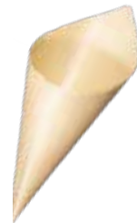
5" CONE sku VT-CN-05 Qty: 1000