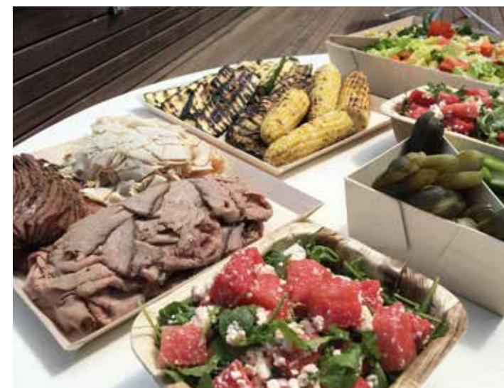
sku TG-DE-I2D, TG-DE-I2S