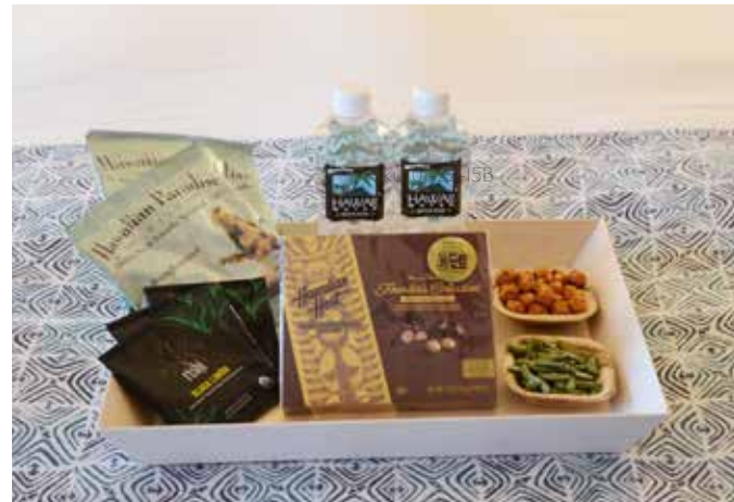
sku TG-DE-IX5, 01-01-11B