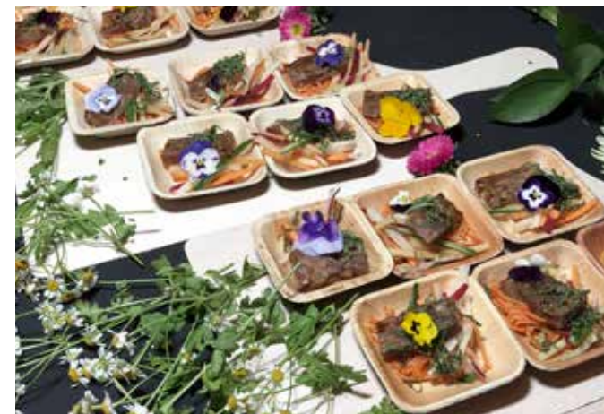
sku 01-00-18B, CB-RC-8X2

VerTerra is the ultimate sustainable solution to catering. We offer products that are perfect for on and off premise. From buffets to a seated event or passed appetizers, you will love the lightweight durable products with lower staffing needs for service and cleanup. Your customers will love the modern appearance and will enjoy that the products are environmentally friendly.