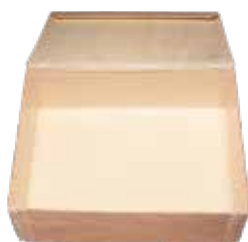
6" x 8" x 3" MEDIUM BOX sku TG-CB-6X8 Qty: 300