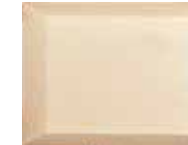
5"x 7" MEDIUM RECTANGLE sku TG-DE-5X7 Qty: 300