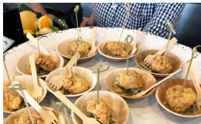
sku 01-01-10B, VT-2406

Our minis have become the tasting industry standard with over 500+ major events using our products, such as: Aspen F&W, Feast Portland, Palm Beach Food and Wine, and more. Our "smalls" the 2.5", 3", 3.5", 4", and 6" products make it easy for you to run a compostable event, lowering staffing needs, and the added bonus of gorgeous food images. Our smalls will showcase the food and your event in the best light.