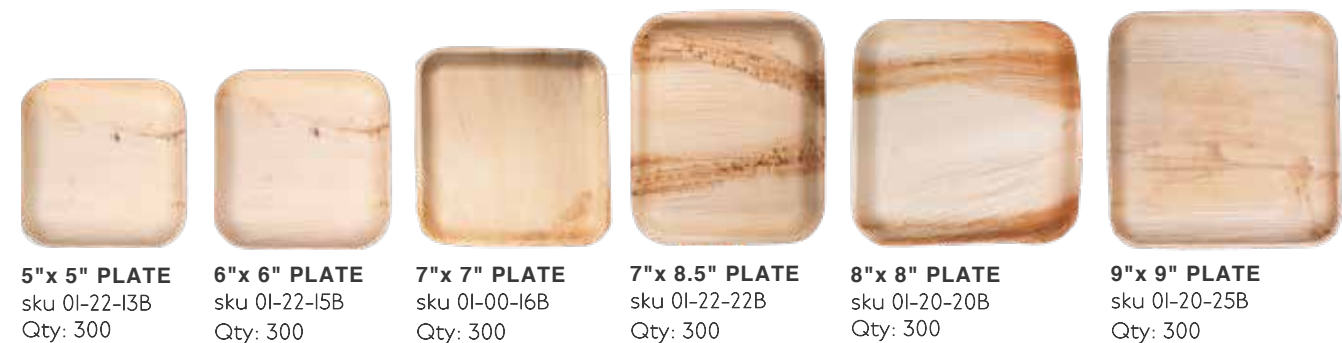
5" x 5" PLATE sku 01-22-13B Qty: 300 6" x 6" PLATE sku 01-22-15B Qty: 300 7" x 7" PLATE sku 01-00-16B Qty: 300 7" x 8.5" PLATE sku 01-22-22B Qty: 300 8" x 8" PLATE sku 01-20-20B Qty: 300 9" x 9" PLATE sku 01-20-25B Qty: 300