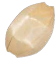
5" WOODEN BOAT sku VT-BT-05 Qty: 1000

Our range of boats are popular for events and outdoor entertainment. Economically priced, these items are cost effective and get the job done! patent