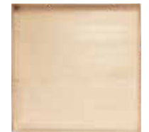
6"x 6" DISH COLLAPSIBLE sku TG-CS-6X6 Qty: 300