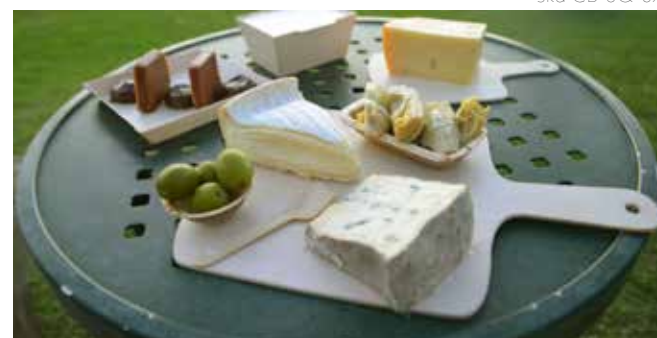
sku CB-SQ-8X8, 01-22-05B, TG-SE-5X5, TG-LB-3X4, CB-SQ-5X5