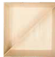
7"x 7" x 4" DEEP 3LB FIXED SIDED VESSEL W/ PARTITION sku TG-DE-07D Qty: 50