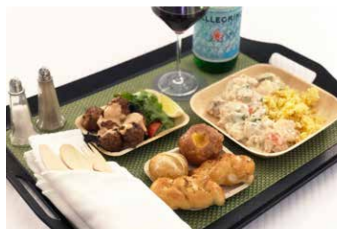
sku 01-22-05B, 01-22-10B, 01-22-13B