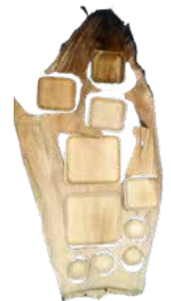
Palm leaf becoming VerTerra Dinnerware