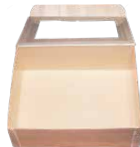
8" x 11" x 3" LARGE BOX W/ WINDOW LID sku WB-CB-8XI Qty: 50