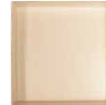
7"x 7" SQUARE sku TG-DE-7X7 Qty: 300