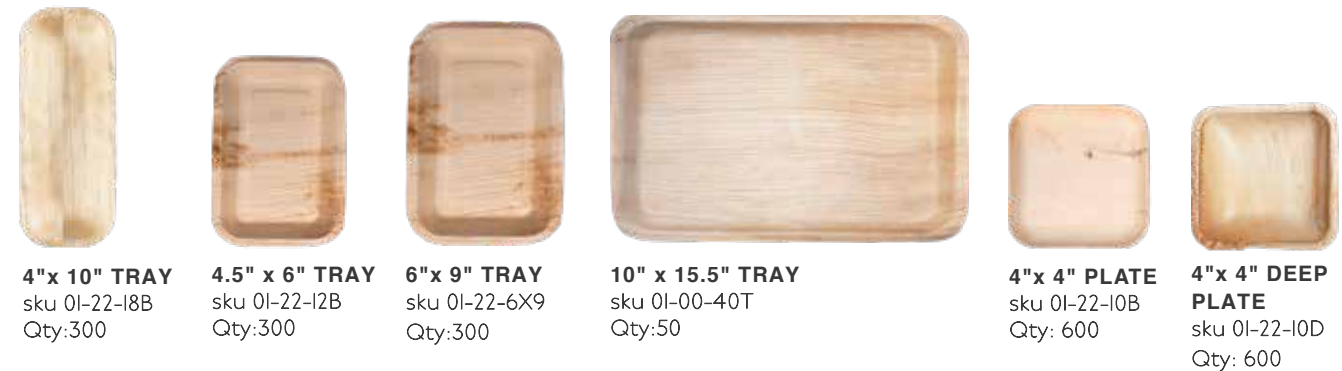
4"x 10" TRAY sku 01-22-18B Qty: 300 4.5" x 6" TRAY sku 01-22-12B Qty: 300 6" x 9" TRAY sku 01-22-6X9 Qty: 300 10" x 15.5" TRAY sku 01-00-40T Qty: 50 4" x 4" PLATE sku 01-22-10B Qty: 600 4" x 4" DEEP PLATE sku 01-22-10D Qty: 600