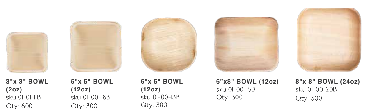
3" x 3" BOWL (2oz) sku 01-01-11B Qty: 600 5" x 5" BOWL (12oz) sku 01-00-18B Qty: 300 6" x 6" BOWL (12oz) sku 01-00-13B Qty: 300 6" x 8" BOWL (12oz) sku 01-00-15B Qty: 300 8" x 8" BOWL (24oz) sku 01-00-20B Qty: 300