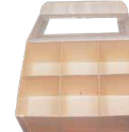
8" x 11" x 3" LARGE VENTO™ BOX W/ WINDOW LID sku WB-BB-8XI Qty: 50