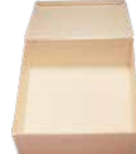
7" x 7" x 3" MEDIUM BOX sku TG-CB-7X7 Qty: 300