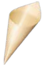
3" CONE sku VT-CN-03 Qty: 1000

Our range of cones are popular for events and outdoor entertainment. Economically priced, these items are cost effective and get the job done!