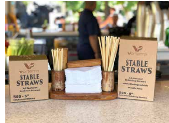
sku STR-05, STR-08