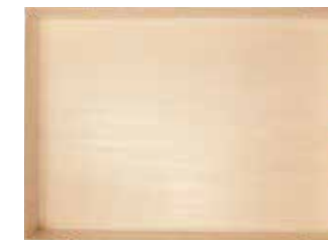
11"x 15"x 3" DEEP LARGE COLLAPSIBLE TRAY sku TG-CS-5XI Qty: 100