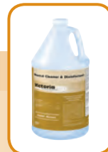
Table Top Sanitizer - RTU