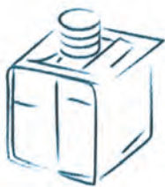
Sturdy, stable construction

FlexMax™ Packaging replaces bulky, clumsy buckets with a container that empties completely and collapses to nothing. Yet it's still durable, and portable thanks to built-in handles. Products in FlexMax™ Packaging are easy to use, convenient to store, and cost efficient to ship. They're durable, lightweight, collapse down flat.