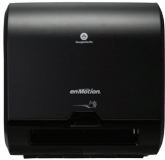
enMotion® Flex Mini Paper Towel System 59798