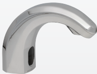
enMotion® Automated Touchless Counter Mount Soap Dispenser 52065

*Ask about our 100% Recyclable bottled soap and sanitizer refills