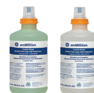
enMotion® Counter Mount Soap Refills