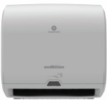
enMotion® 8" Paper Towel System 59497A

*Ask about our 100% Recyclable bottled soap and sanitizer refills