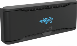
ActiveAire® Automated In-Stall Freshener Dispenser, Black 56768