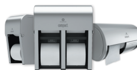
The Compact® Coreless Toilet Paper System is flexible and space saving with long-lasting rolls. The sleek, modern design supports the high standards of your facility.