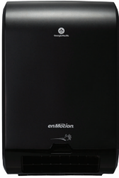
enMotion® Flex Wall Mount Paper Towel System 59762