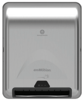
enMotion® Recessed Automated Touchless Paper Towel Dispenser 59466A