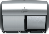
Compact® Side-By-Side Double Roll Toilet Paper Dispenser 56798