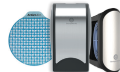
Powered and passive whole room dispensers and deodorizing urinal screens available for total room coverage