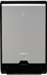
enMotion® Flex Recessed Paper Towel System 59766