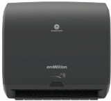
enMotion® 8" Paper Towel System 59498A