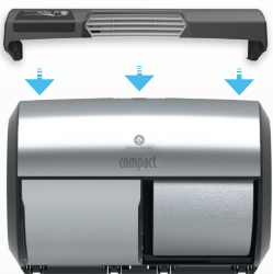
ActiveAire® Automated Freshener Dispenser shown with the Compact® Side-By-Side Toilet Paper Dispenser *Fits on Compact® Dispensers 56761