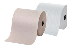
enMotion® Paper Towel Refills