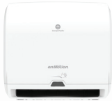
enMotion® 8" Paper Towel System 59437A