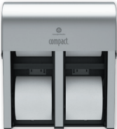
Compact Quad® Four Roll Coreless Toilet Paper Dispenser 56748