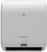
enMotion® 10" Paper Towel System 59460A