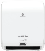
enMotion® 10" Paper Towel System 59407A