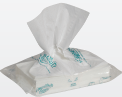
Angel Soft Professional Series® PolyFlex™ Facial Tissue 47580