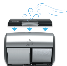
Compact® with ActiveAire® Automated Freshener Dispenser System