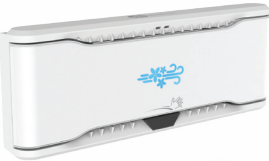
ActiveAire® Automated In-Stall Freshener Dispenser, White 56769