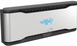
ActiveAire® Automated In-Stall Freshener Dispenser, Stainless Finish 56764