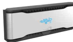
ActiveAire® Automated In-Install Freshener Dispenser

EcoSmart™ by Georgia-Pacific Refills identified as EcoSmart™ may have certain third-party certifications to help you meet your sustainability goals. For more information, visit gppro.com .