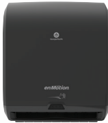
enMotion® 10" Paper Towel System 59462A