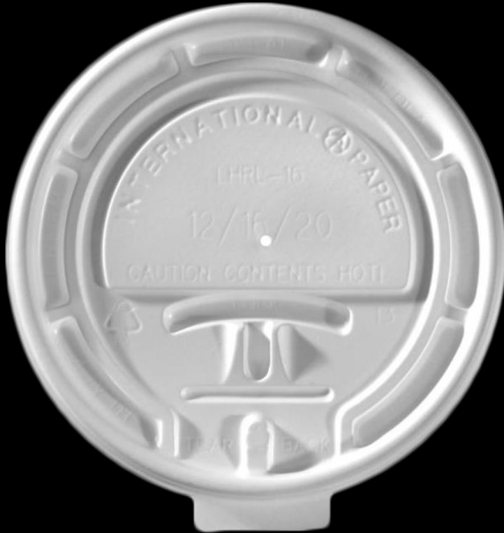
Tear-Away Lid: 1967