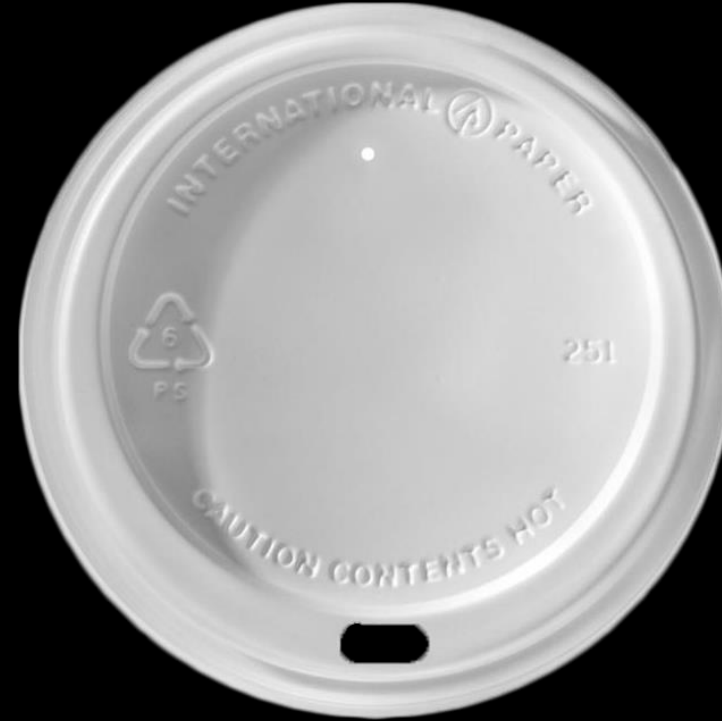
Dome Lid: 1986