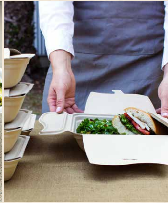
24 oz COMPOST-A-PAK™