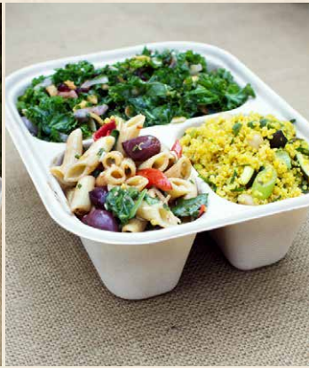
3 Compartment Fiber Tray