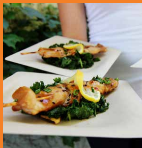
9" Fiber Square Plate