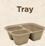
10x7.5x3" 3 Comp TR-SC-10T3, p6