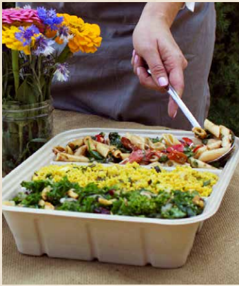
3 Compartment Catering Pan