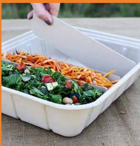
Adjustable Catering Pan